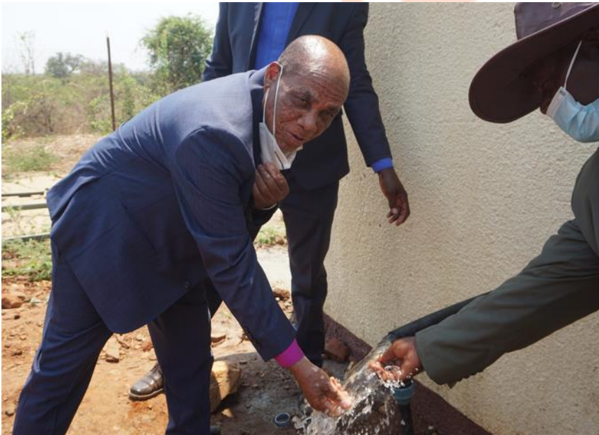
Gushing of water from the borehole