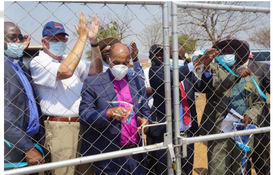
Celebrations after cutting of the ribbon