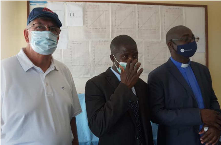
People present during the tour