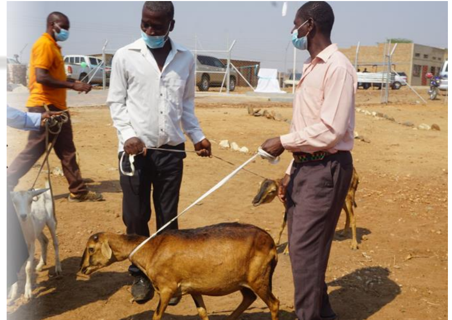
Gifts for the Bishop, MP and Chief

The clinic brought a goat and two sheep. Chief was given a sheep as well as the bishop and a goat was given to the DS.