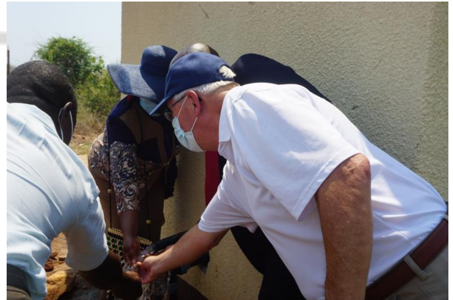
Water gushing out from the dedicated borehole