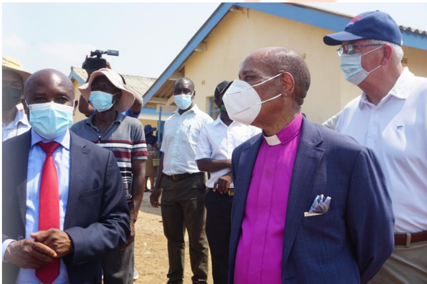
Touring the building