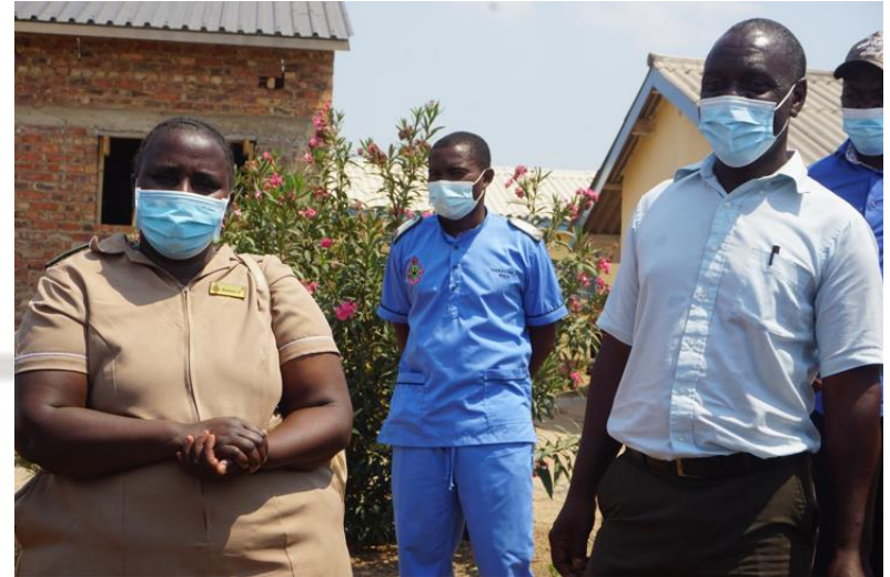
Team from Mutawatawa hospital