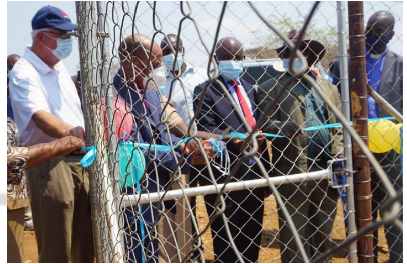
Cutting of the ribbon