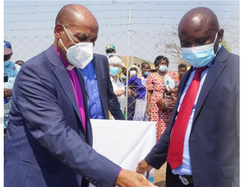
Removal of the material from the plaque