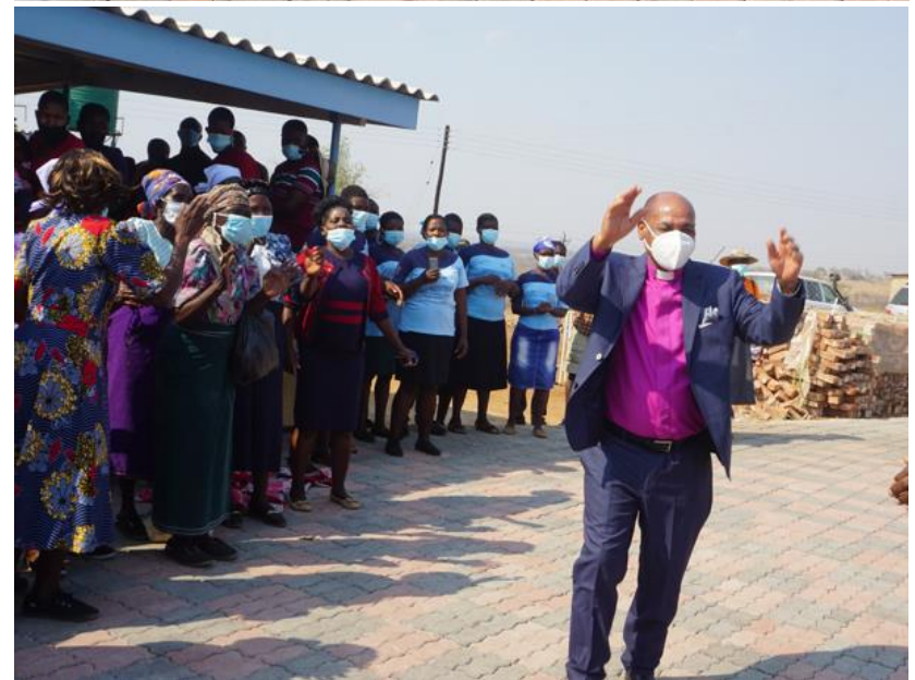
The Bishop picking a dance as he was welcomed by members singing and ululating.