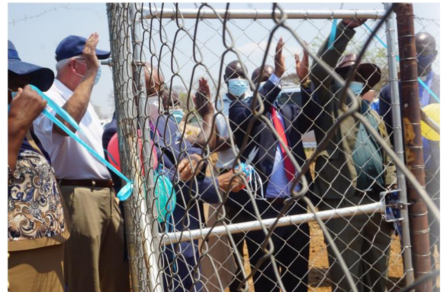
Cutting of the ribbon.