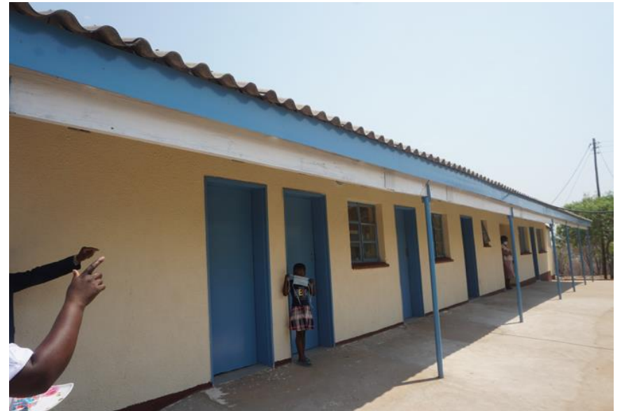
Waiting mothers shelter.