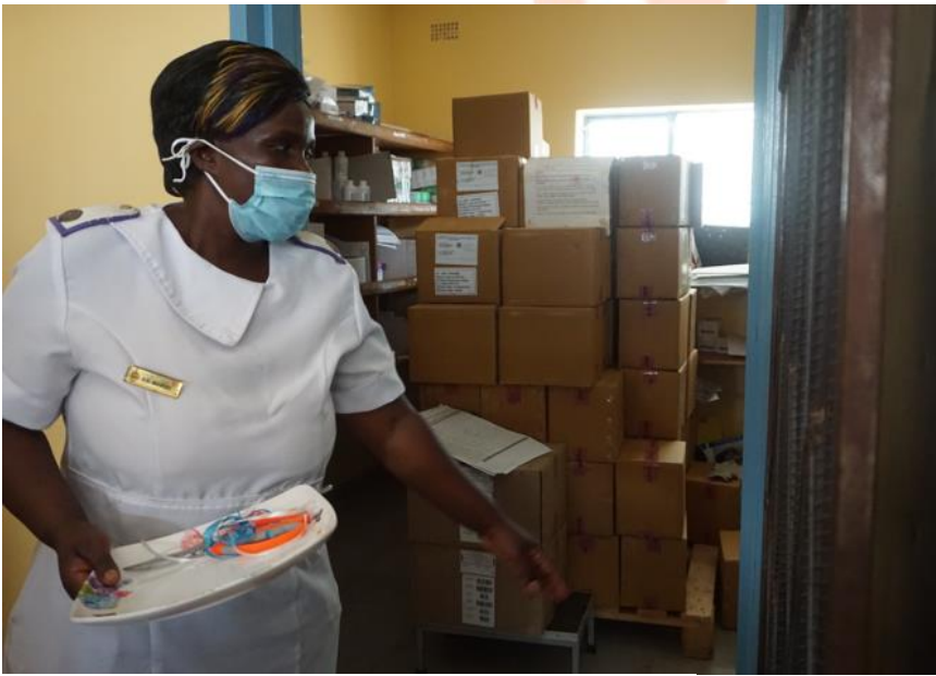
Drug room to be a dispensary room soon.