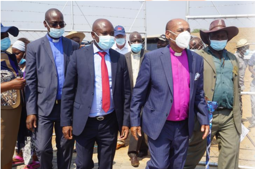
Touring the buildings