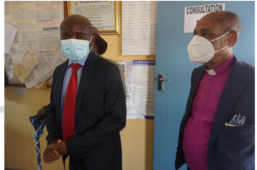
In the consultation room – The Bishop and the MP