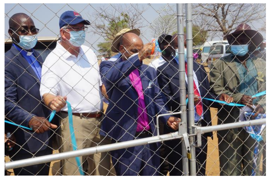
Cutting of the ribbon