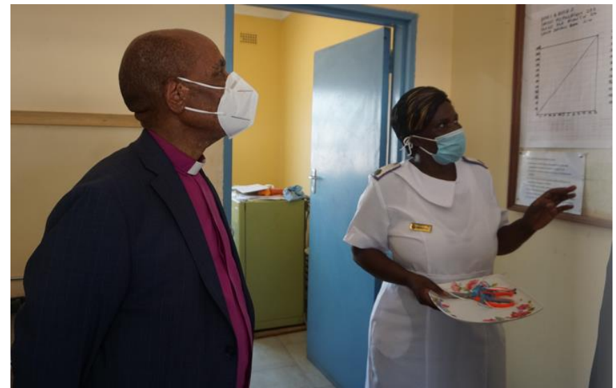
Explaining the records