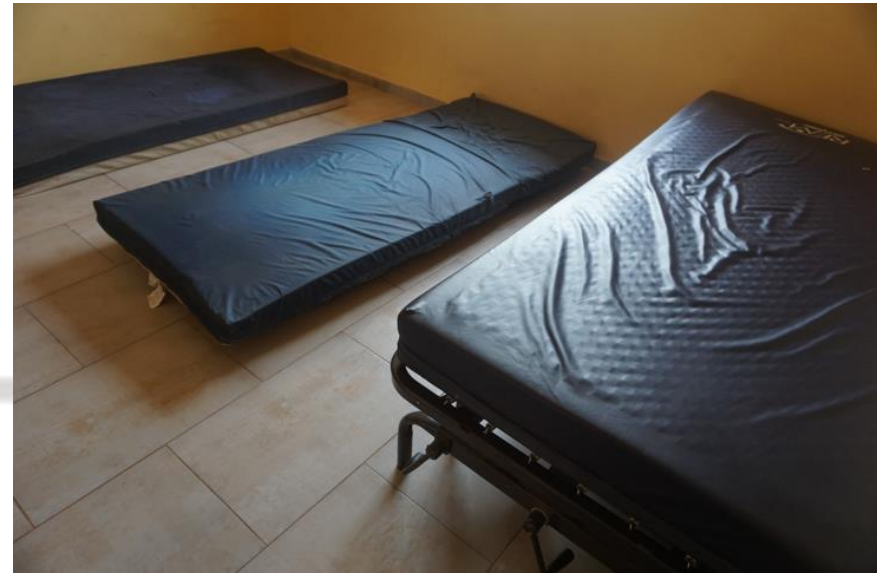
Labour ward and postnatal.